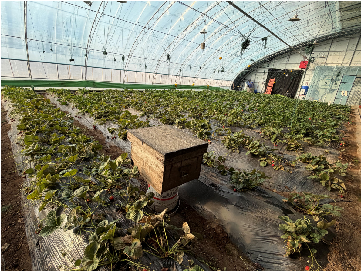
Figure 4: Hydroponic rows of strawberry plants in a greenhouse.

management system. For instance, hydroponic systems, as shown in Fig. 4, represent an advanced cultivation model that enhances resource use efficiency and spatial productivity. The system depicted is a nutrient film technique (NFT) hydroponic system, in which strawberry plants are grown in individual containers filled with soilless growing media-typically a coconut coir and perlite blend-placed along slightly inclined channels. A thin layer of nutrient solution continuously flows through the channels, providing roots with a balanced supply of water, oxygen, and essential minerals while allowing excess solution to be recirculated. This design enables precise regulation of root zone conditions, minimizes water and fertilizer waste, and effectively eliminates soil-borne diseases that commonly plague conventional strawberry production under continuous cropping regimes.