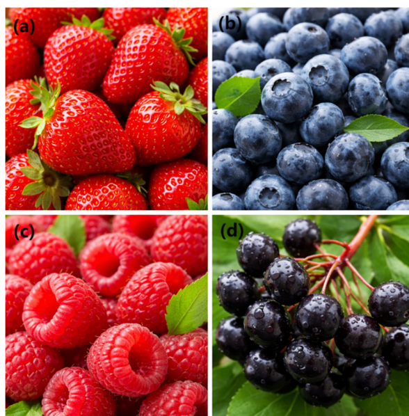
Figure 2: Representative small berries: (a) strawberries, (b) blueberries, (c) raspberries, (d) aronia berries.

As shown in Fig. 2, small berries encompass a diverse range of species, each with unique attributes, yet they share common features such as compact fruit size, high nutrient density, and considerable economic value. A thorough understanding of the distinct growth characteristics and ecological adaptations of different small berries is a prerequisite for scientific cultivation aimed at achieving high quality and yield. This chapter outlines the basic botanical features and core environmental requirements of four representative small berries: strawberry, blueberry, raspberry, and aronia berry.