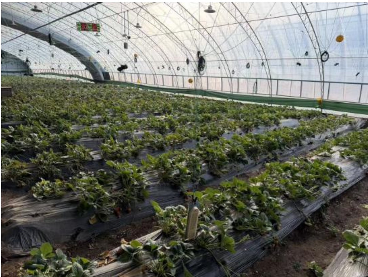
Figure 3: Strawberries grown under protected cultivation. Strawberries have shallow roots ( \approx 15-20 cm) and specific environmental needs.

The achievement of high quality and yield in strawberry production is fundamentally based on a precise understanding and meticulous regulation of its growth characteristics. Compared to other small berries, strawberries have a shorter growth cycle, faster organ turnover, and their economic yield-the fruit-develops directly from the reproductive receptacle [45]. Consequently, they exhibit extremely sensitive and rapid responses to environmental factors and nutritional conditions. A thorough analysis of their core requirements and response mechanisms regarding soil, water, temperature, light, and nutrition forms the theoretical cornerstone for achieving scientific and precise management in protected strawberry cultivation (Fig. 3 shows strawberries grown using protective cultivation methods.).